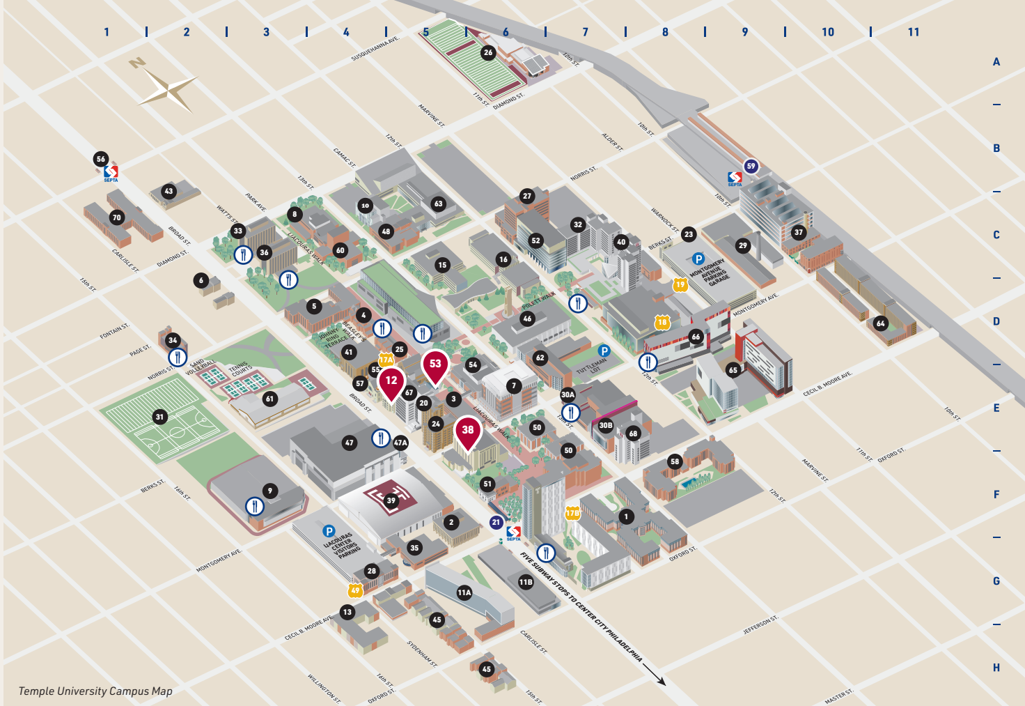
Temple University Campus Map

Cecil B. Moore Subway Station and Plaza Temple University Regional Rail Station See rates and hours at septa.org