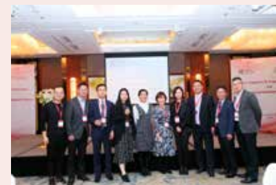
↑ Program staff and alumni