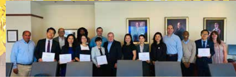
↑ Blank Rome interns