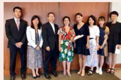
↑ Morgan Lewis interns