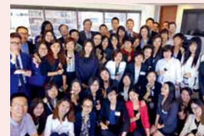
↑ Hangley law firm visit

With nearly 800 members, the Temple Law Alumni Association of China (TLAAC) actively holds events each year. TLAAC gives students a strong platform for networking, knowledge sharing, and professional development.