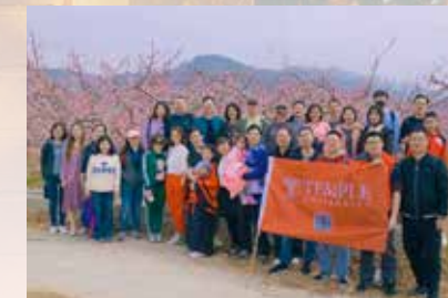
↑ Spring outing