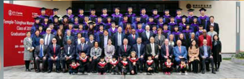
↑ Graduation Ceremony