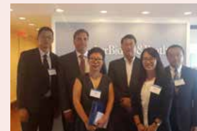
↑ Faegre Drinker Biddle & Reath LLP interns