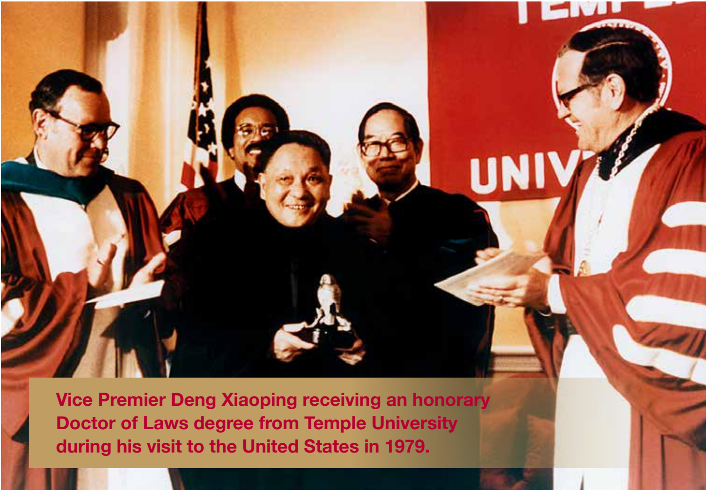
Vice Premier Deng Xiaoping receiving an honorary Doctor of Laws degree from Temple University during his visit to the United States in 1979.