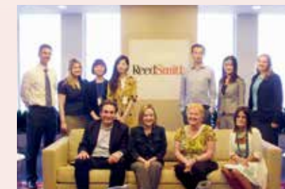
↑ Reed Smith LLP interns