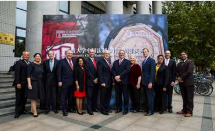
15 th anniversary celebration