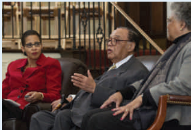
ANN CLAIRE WILLIAMS, WILLIAM T. COLEMAN JR. AND LOVIDA H. COLEMAN

An early story establishes his passion for justice—and his talent in the courtroom. Coleman was drafted into the Army air force. Although he wanted to be a fighter pilot, he was told his reaction time wasn't fast enough. Finding himself in a staff job, he began to volunteer to defend air forces personnel, winning all but one of his cases. When he was later assigned to the same base as the Tuskegee Airmen, he found that this heroic squadron was not allowed to use the regular officers' club. They were instead assigned to a facility they called "Uncle Tom's Cabin." When the airmen protested and were court-martialed, Coleman took their case. In the course of litigation, Coleman discovered and produced a directive from President Wilson stating that all officers' clubs were open to all officers. The defendants were acquitted. The surrounding publicity contributed to the pressure that eventually resulted in President Truman's announcement that the armed forces would be fully, meaningfully, integrated.