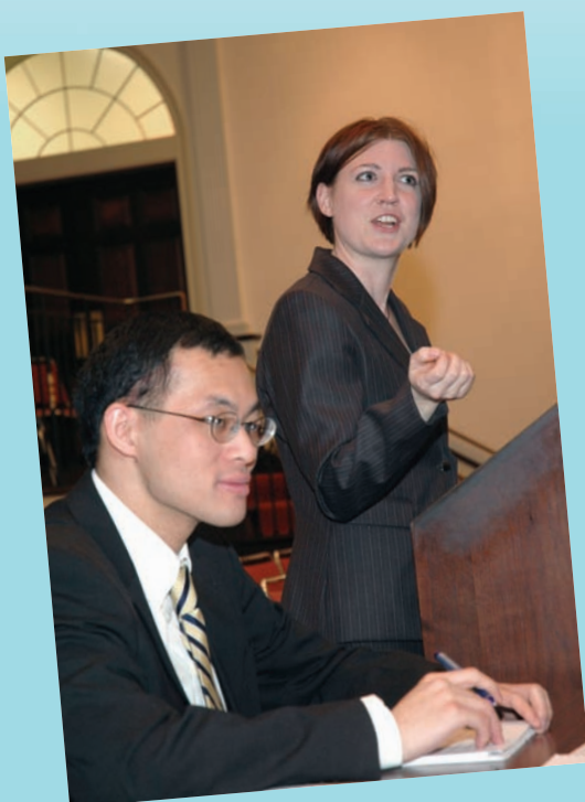
International Moot Court Competition, see story page four

NON-PROFIT ORGANIZATION U.S. POSTAGE PAID PHILADELPHIA, PA PERMIT NO. 1044