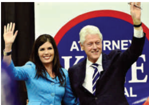
KATHLEEN KANE '93 WAS ENDORSED BY PRESIDENT CLINTON IN HER SUCCESSFUL RUN FOR PA ATTORNEY GENERAL.

In May 2013, Attorney General of Pennsylvania Kathleen Kane will address the graduating law school class as the featured commencement speaker.