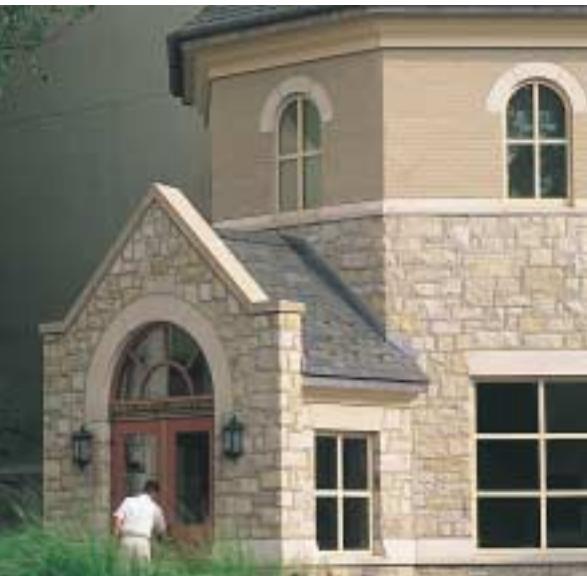
A seminar room in the newly-renovated Barrack Hall is named in recognition of the generosity of the law firm of Levy, Angstreich, Finney, Baldante, Rubenstein & Coren, P.C.