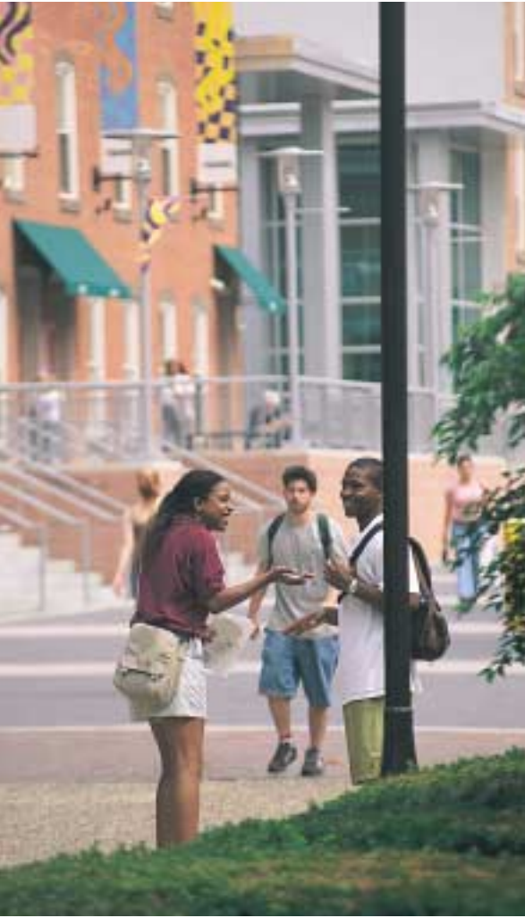
Liacouras Walk connects the law school's three buildings: Klein Hall, Shusterman Hall and Barrack Hall.